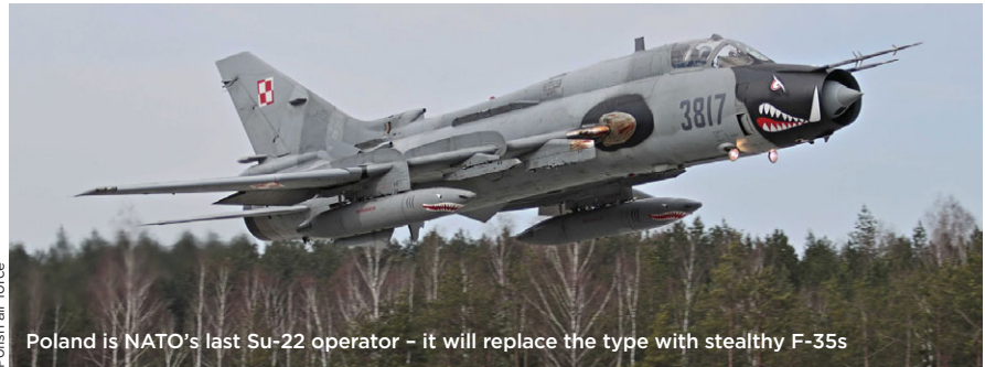
Polish air force