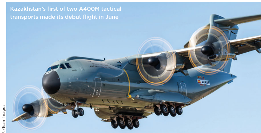
Kazakhstan's first of two A400M tactical transports made its debut flight in June