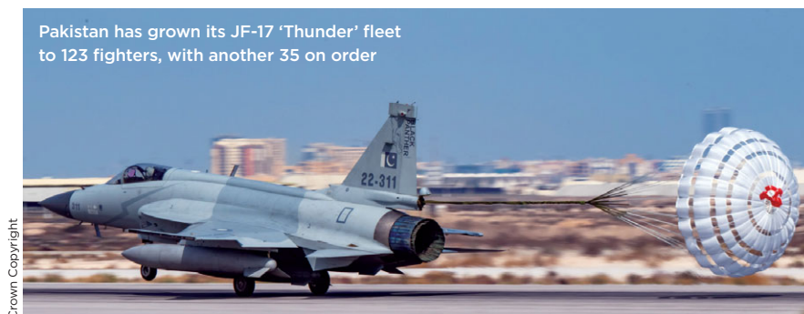
Pakistan has grown its JF-17 'Thunder' fleet to 123 fighters, with another 35 on order