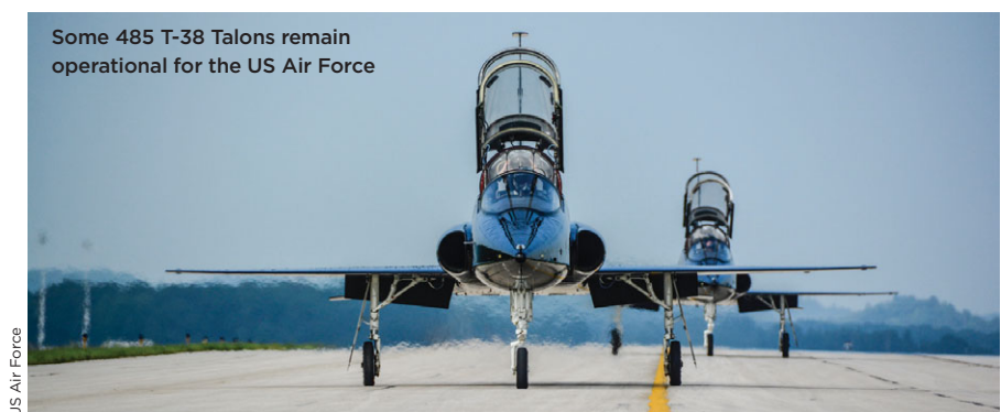
US Air Force