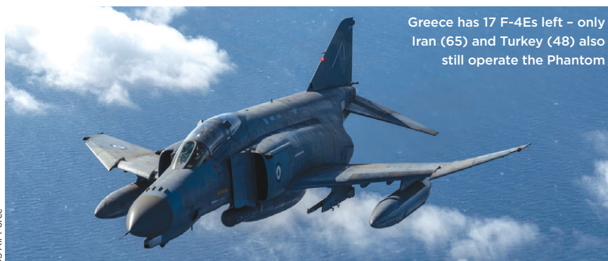
Greece has 17 F-4Es left – only Iran (65) and Turkey (48) also still operate the Phantom