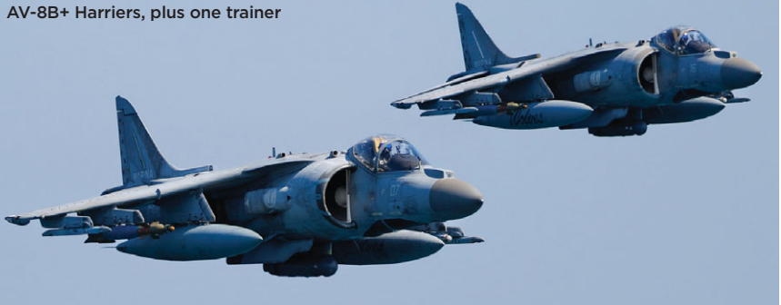
The Italian navy employs a dozen AV-8B+ Harriers, plus one trainer