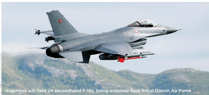
Norwegian defence ministry