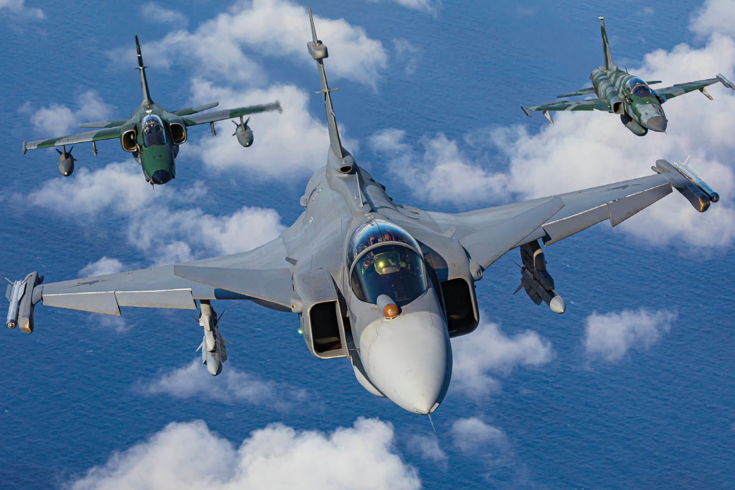
Brazilian air force

The information contained in this report was prepared using Cirium fleets data, and whilst reasonable care has been taken to ensure accuracy, the information is supplied on the understanding that no legal liability whatsoever shall attach to FlightGlobal, its offices, or employees in respect of any error or omission that may have occurred.