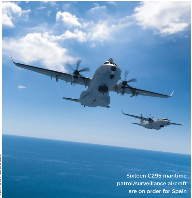
Sixteen C295 maritime patrol/surveillance aircraft are on order for Spain

Also excluded are more than 730 aircraft permanently assigned to performing VIP,