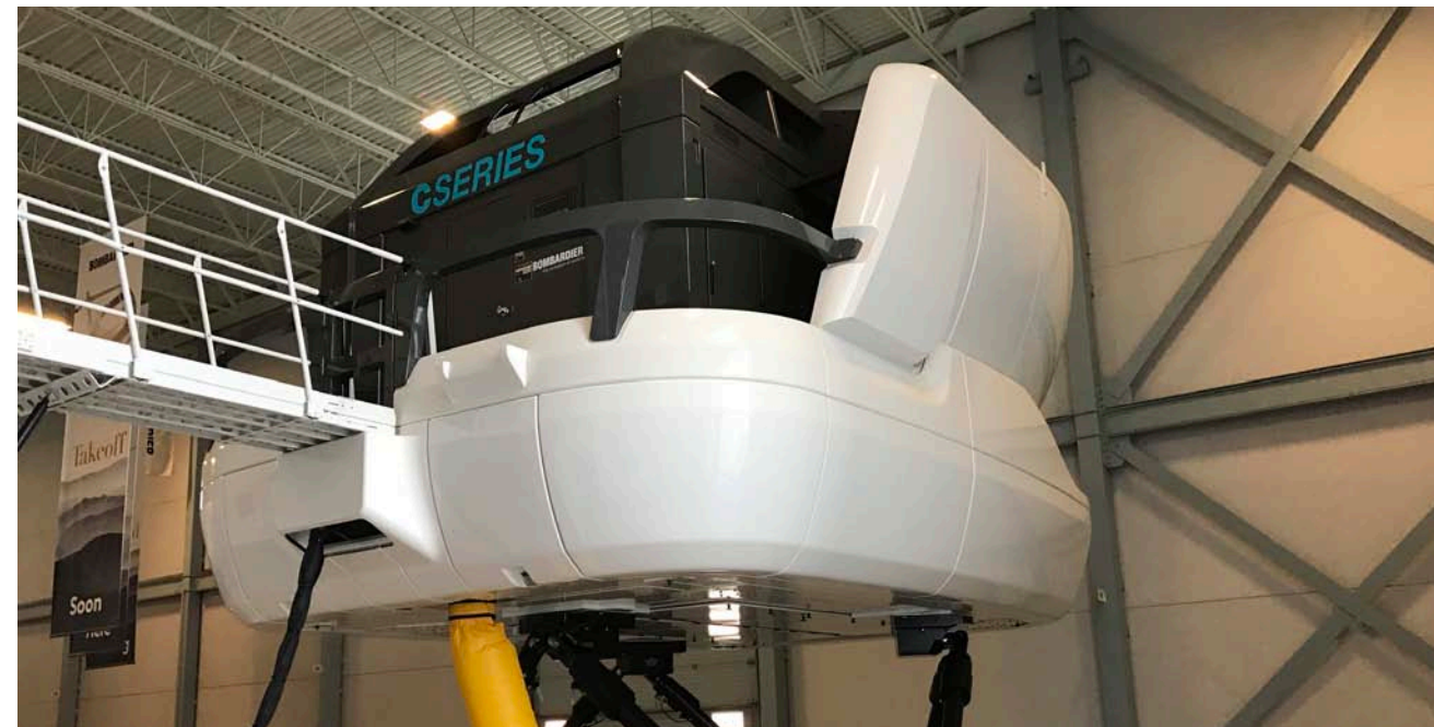
There are currently in operation, or on order, a total of five CAE-built Bombardier C Series full-flight simulators worldwide