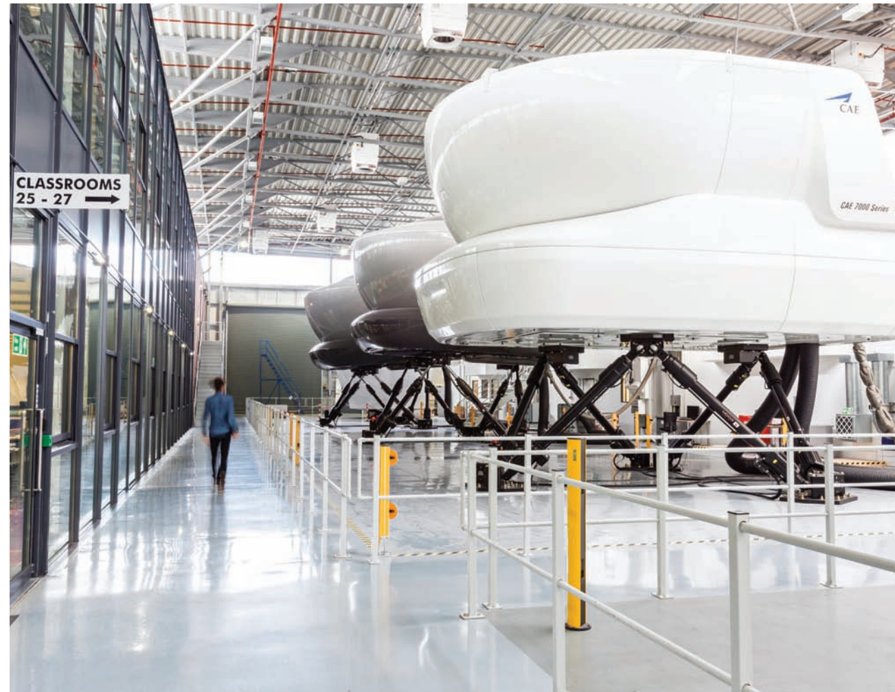
An exterior view of CAE London Burgess Hill, equipped with both commercial and business aviation FFS platforms