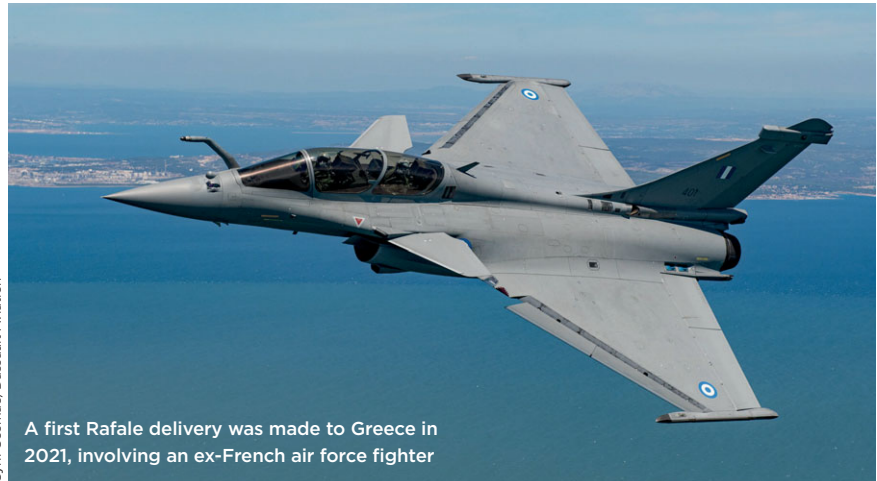
A first Rafale delivery was made to Greece in 2021, involving an ex-French air force fighter