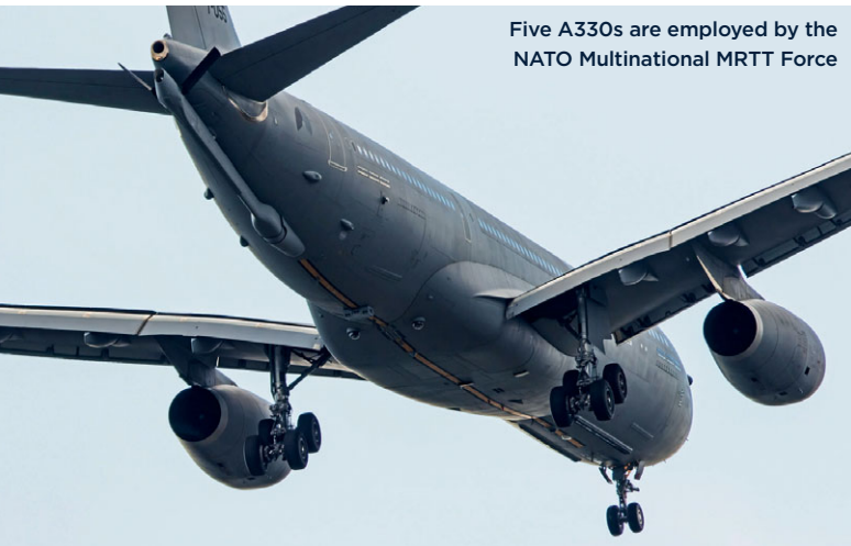
Five A330s are employed by the NATO Multinational MRTT Force