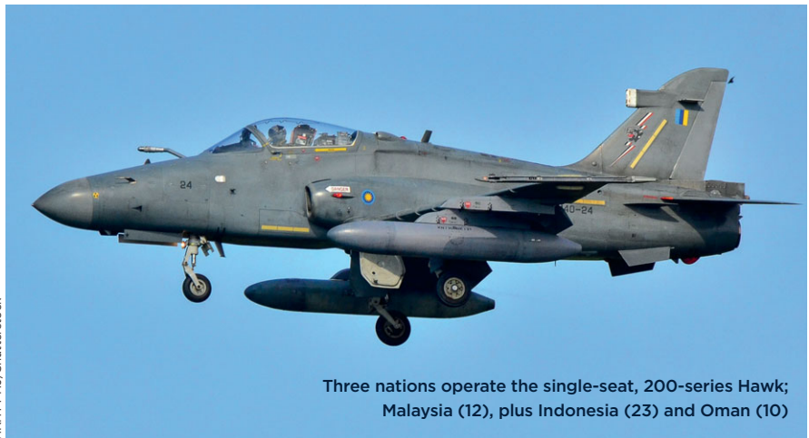
Three nations operate the single-seat, 200-series Hawk; Malaysia (12), plus Indonesia (23) and Oman (10)