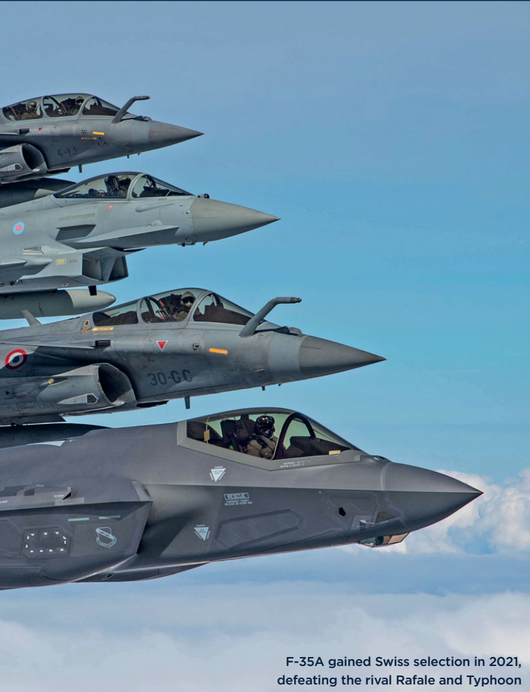
F-35A gained Swiss selection in 2021, defeating the rival Rafale and Typhoon