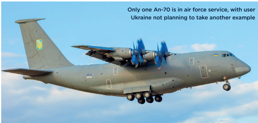
Only one An-70 is in air force service, with user Ukraine not planning to take another example