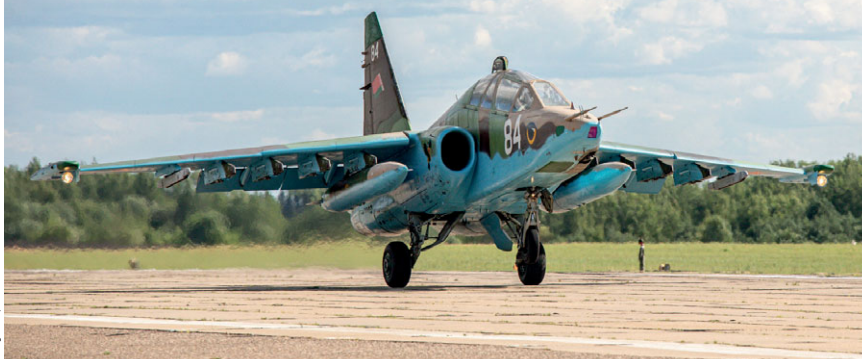
With 67 Su-25s in use, Belarus is the combat type's second-largest operator, after Russia