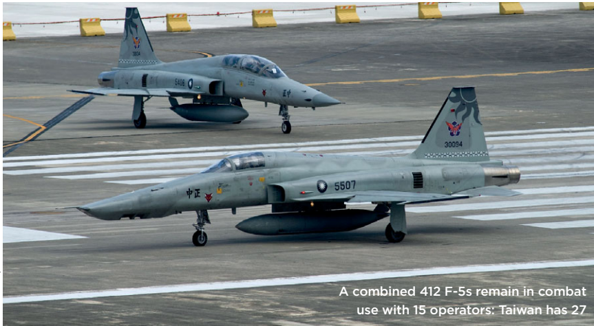
A combined 412 F-5s remain in combat use with 15 operators: Taiwan has 27