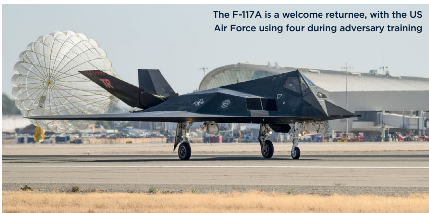
The F-117A is a welcome returnee, with the US Air Force using four during adversary training