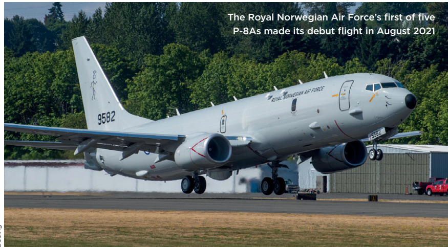
The Royal Norwegian Air Force's first of five P-8As made its debut flight in August 2021