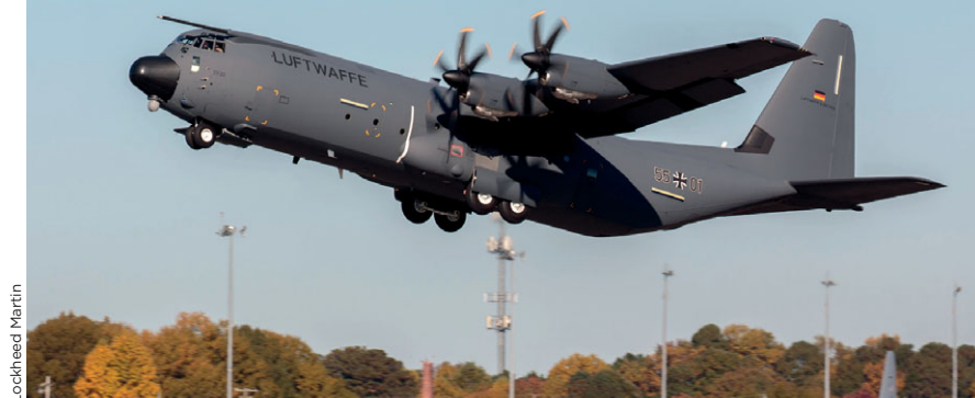
Germany's lead C-130J first flew on 8 November. Its six examples will include three tankers