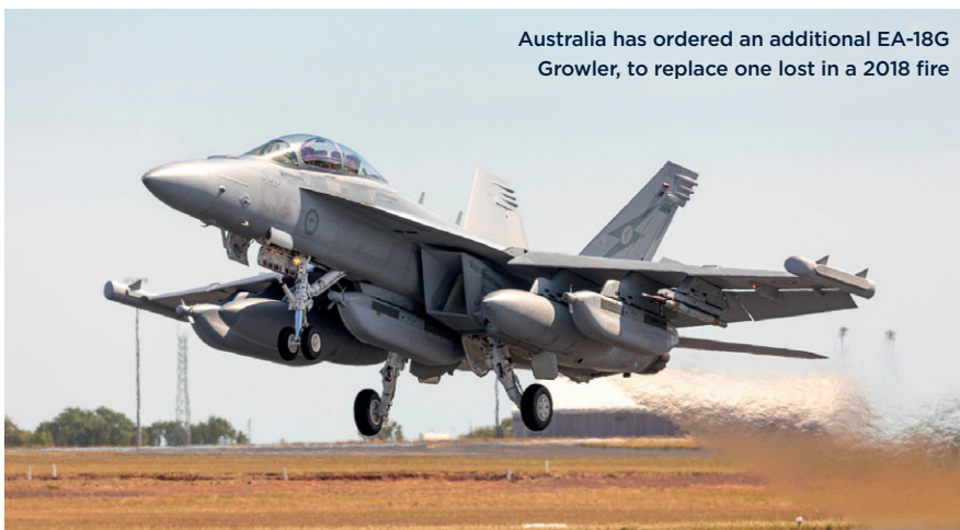
Australia has ordered an additional EA-18G Growler, to replace one lost in a 2018 fire