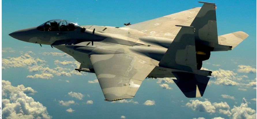
Qatar's first batch of four F-15QAs has been delivered – it could in time field up to 72