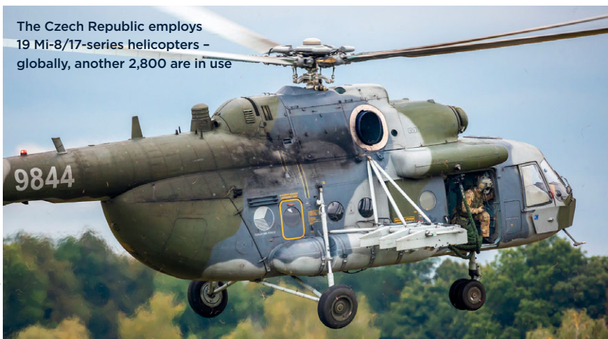
The Czech Republic employs 19 Mi-8/17-series helicopters – globally, another 2,800 are in use