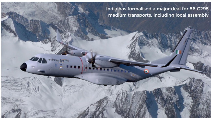
India has formalised a major deal for 56 C295 medium transports, including local assembly