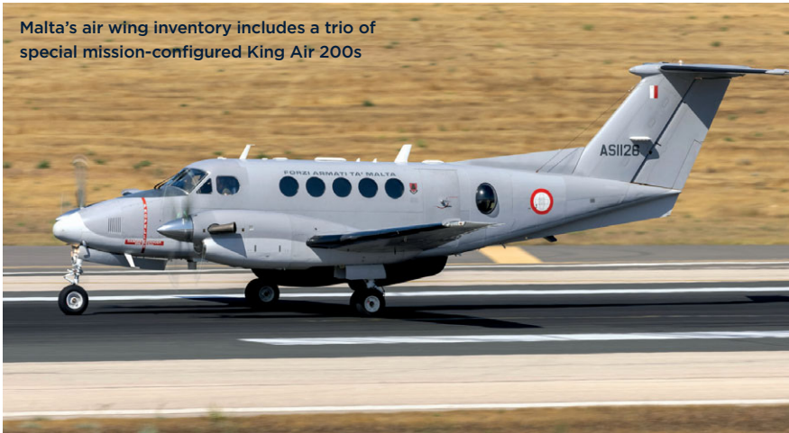
Malta's air wing inventory includes a trio of special mission-configured King Air 200s